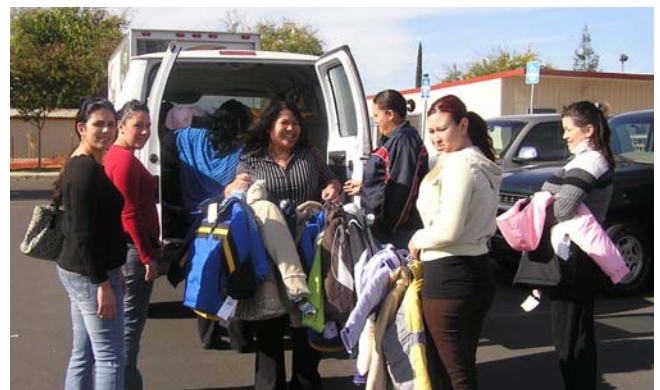
Staff and participants unloading the coats and jackets at Don Stowell Elementary.