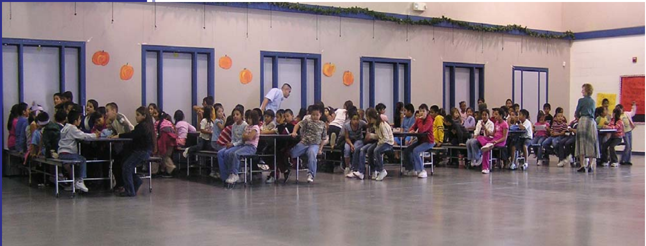
Students waiting for the other children to come into the cafeteria before we begin to distribute the coats.