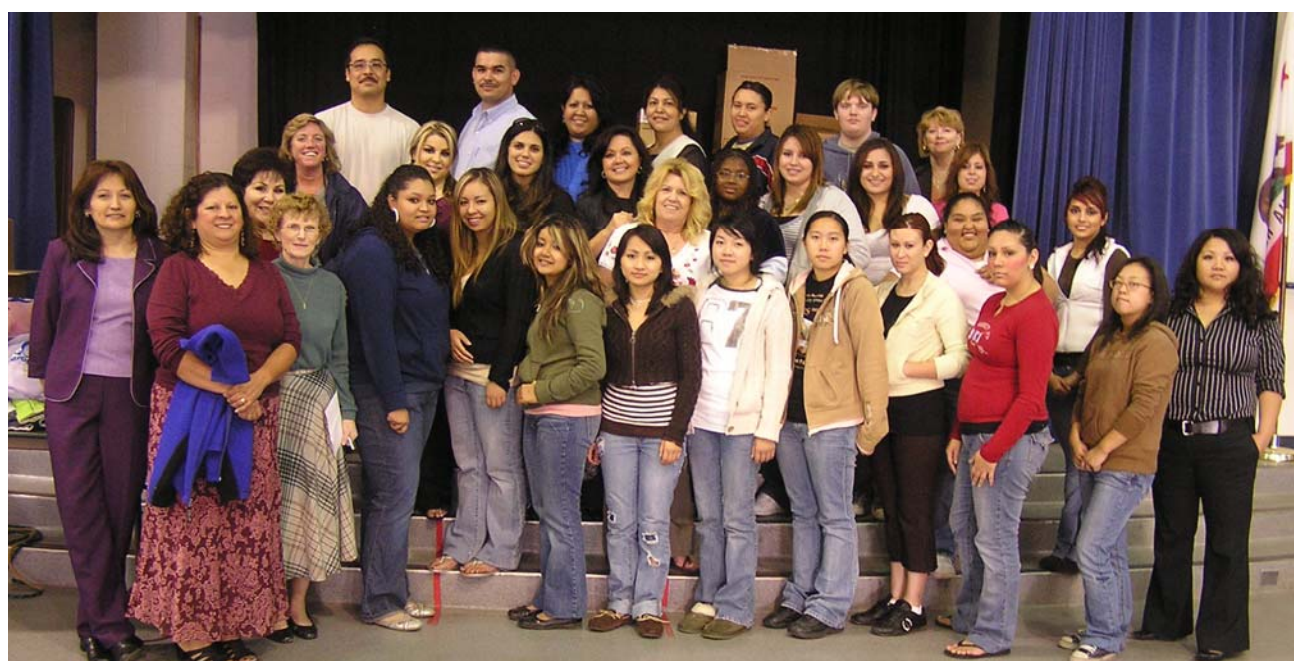
Staff and participants who helped with the distribution of coats