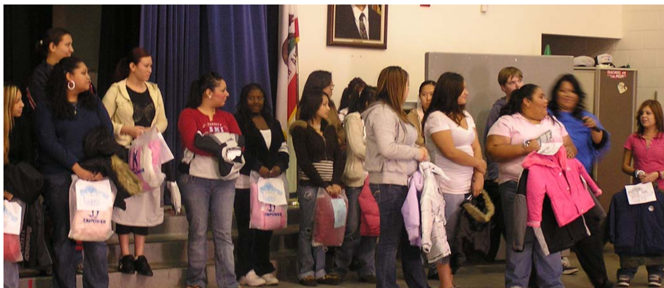
Participants stand ready to hand out coats and jackets to students as their names are being called.